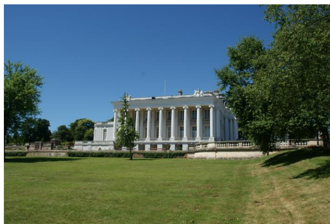
Oldway Mansion & Bowling 1